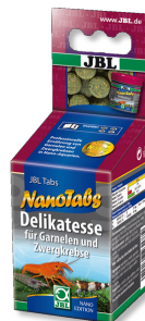
JBL NanoTabs Main food for shrimp and dwarf crayfish