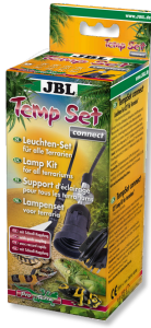
JBL TempSet connect Installation kit with connector