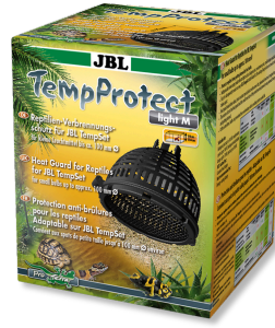
JBL TempProtect light Reptile thermal burn protection for JBL TempSets