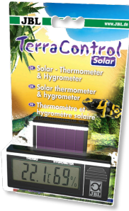
JBL TerraControl Solar Solar-powered thermometer + hygrometer for terrariums