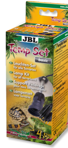
JBL TempSet basic Installation kit for lamps in terrariums