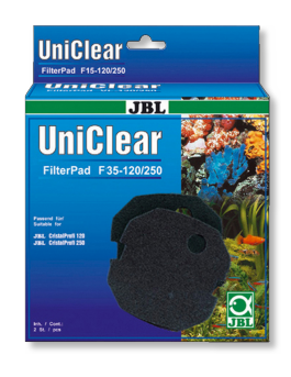
JBL FilterPad F35 Fine foam pad for aquarium filter CristalProfi