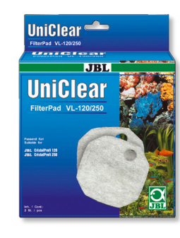
JBL FilterPad VL Cotton fleece for CristalProfi aquarium filters

You can find a complete overview here: https://www.jbl.de/qr/62375