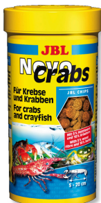
JBL NovoCrabs Main food wafers for crabs