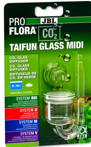
JBL PROFLORA CO2 TAIFUN GLASS Glass CO2 diffuser for freshwater tanks from 40-300 l