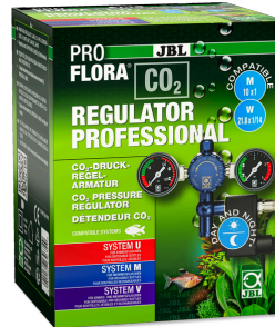
JBL PROFLORA CO2 REGULATOR PROFESSIONAL Pressure regulator with 2 displays & valve for CO2