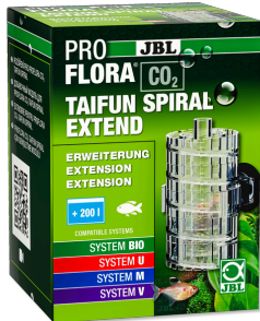
JBL PROFLORA CO2 TAIFUN SPIRAL EXTEND Extension for JBL PROFLORA CO2 TAIFUN SPIRAL 5 / 10