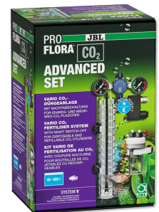
JBL PROFLORA CO2 ADVANCED SET V CO2 system (NO BOTTLE!) with gauges & solenoid valve