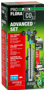
JBL PROFLORA CO2 ADVANCED SET U CO2 plant fertil. system compl. set + night switch-off