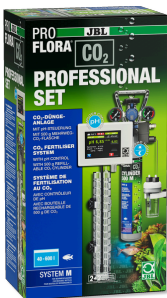
JBL PROFLORA CO2 PROFESSIONAL SET M CO2 plant fertiliser system with CO2 control computer