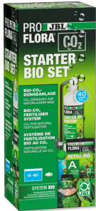
JBL PROFLORA CO2 STARTER BIO SET Bio-CO2 fertiliser system for freshw. tanks (10-40 l)