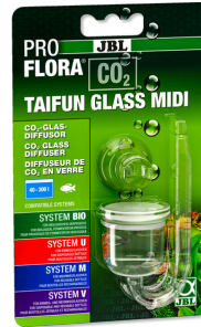
JBL PROFLORA CO2 TAIFUN GLASS Glass CO2 diffuser for freshwater tanks from 40-300 l