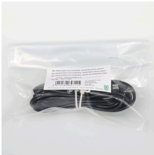
JBL PF CO2 CONTROL temperature sensor