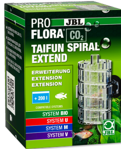
JBL PROFLORA CO2 TAIFUN SPIRAL EXTEND Extension for JBL PROFLORA CO2 TAIFUN SPIRAL 5 / 10