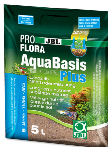
JBL PROFLORA AquaBasis plus

Plant fertiliser for freshwater aquariums