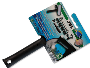
JBL Aqua-T Triumph Glass pane cleaner with spare blades and rubber scraper