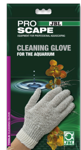
JBL PROSCAPE CLEANING GLOVE Aquarium cleaning glove