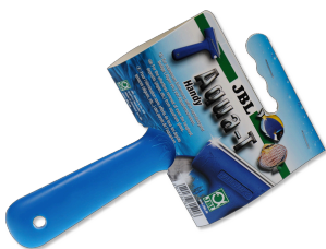
JBL Aqua-T Handy Glass pane cleaner with stainless steel blade