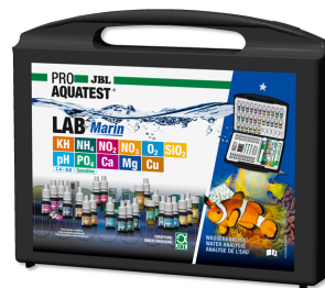
JBL PROAQUATEST LAB Marin Professional test case for marine water analysis