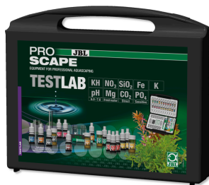
JBL PROAQUATEST LAB PROSCAPE Test case for water analysis in plant aquariums