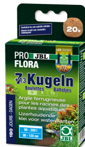
JBL PROFLORA 7 + 13 Balls Root fertiliser for freshwater aquariums