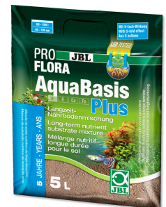
JBL PROFLORA AquaBasis plus Long-lasting nutrient substrate f. freshwater aquarium