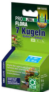
JBL PROFLORA 7 Balls Root fertiliser for freshwater tanks (7 fertil. balls)