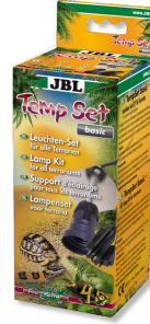
JBL TempSet basic Installation kit for lamps in terrariums