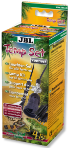
JBL TempSet connect Installation kit with connector