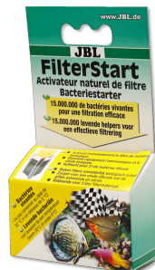
JBL FilterStart Bacteria for the activation of filters