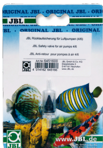
JBL backflow protection