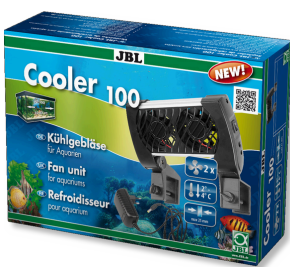
JBL Cooler 100 Cooling fan for fresh- and saltwater aquariums