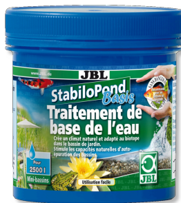
JBL StabliPond Basis Basic care product for all garden ponds