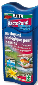
JBL BactoPond Bacteria for biological purification of the pond