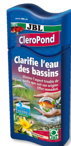
JBL CleroPond Water clarifier for the elimination of water cloudiness