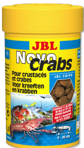
JBL NovoCrabs Main food wafers for crabs