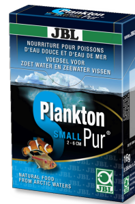
JBL Plankton Pur SMALL Treats for small aquarium fish