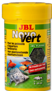
JBL NovoVert Main food flakes for plant-eating fish