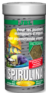
JBL Spirulina Premium main food for algae-eating aquarium fish