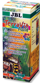
JBL TerraVit fluid Vitamins and trace elements for terrarium animals