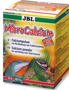
JBL MicroCalcium Mineral supplementary food for all reptiles