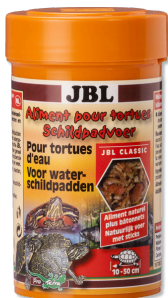
JBL Turtle Food Main food with crayfish for turtles