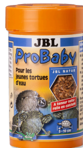
JBL ProBaby Special food for young turtles