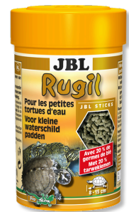
JBL Rugil Food sticks for small turtles