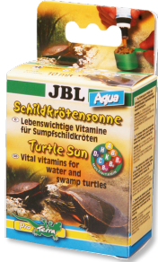
JBL Turtle Sun Aqua Vitamins for turtles and pond terrapins