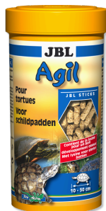
JBL Agil Main foodsticks for turtles 10 – 50 cm in size