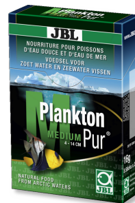
JBL PlanktonPur MEDIUM Treats for large aquarium fish