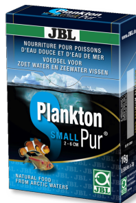
JBL PlanktonPur SMALL Treats for small aquarium fish