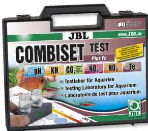
JBL Test Combi Set plus Fe Test case with most important water tests + iron test