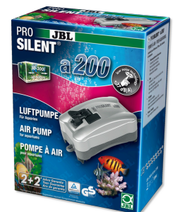
JBL PROSILENT a200 Air pump for fresh and saltwater aquariums