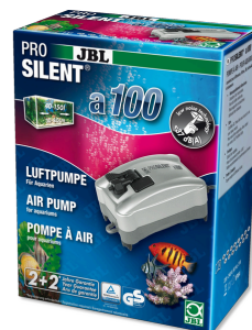
JBL PROSILENT a100 Air pump for fresh and saltwater aquariums