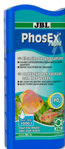
JBL PhosEx rapid Phosphate remover for freshwater aquariums