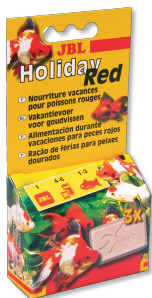
JBL Holiday Red Complete holiday food for goldfish