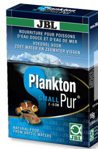
JBL PlanktonPur SMALL Treats for small aquarium fish