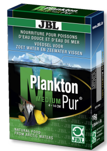
JBL PlanktonPur MEDIUM Treats for large aquarium fish