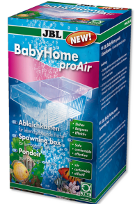
JBL BabyHome pro Air Spawning box for air stone installation