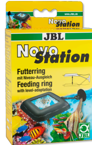
JBL NovoStation Floating feeding ring with water level adaption