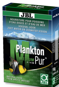
JBL PlanktonPur MEDIUM