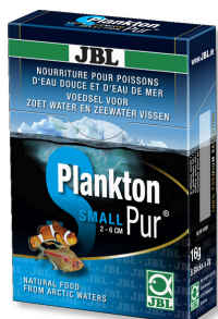
JBL PlanktonPur SMALL