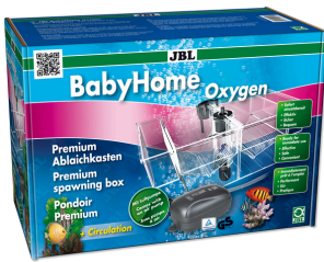
JBL BabyHome Oxygen Premium spawning box complete kit with air pump