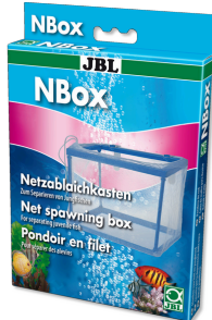
JBL NBox Net Spawning Box