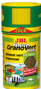
JBL NovoGranoVert mini CLICK

Main food granulate for plant-eating fish