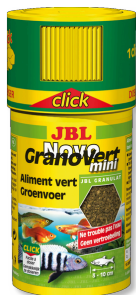
JBL NovoGranoVert mini CLICK

Main food granulate for plant-eating fish