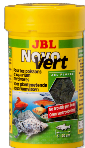
JBL NovoVert Main food flakes for plant-eating fish