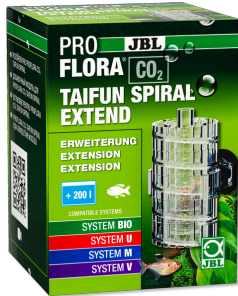
JBL PROFLORA CO2 TAIFUN SPIRAL EXTEND Extension for JBL PROFLORA CO2 TAIFUN SPIRAL 5 / 10