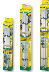
JBL SOLAR Reflect T5/ T8 - 895-1500 mm Reflector panel for fluorescent tube