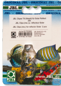
JBL Clips T5/T8 (Metal) Metal holder für fluorescent tubes