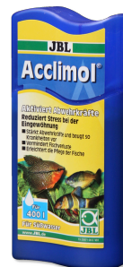
JBL Acclimol Water conditioner for acclimatisation