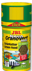
JBL NovoGranoVert mini CLICK

Main food granulate for plant-eating fish