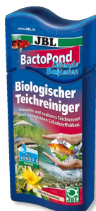
JBL BactoPond Bacteria for biological purification of the pond