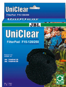
JBL FilterPad F15 Coarse foam pad for aquarium filter CristalProfi