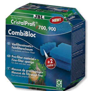
JBL CombiBloc CristalProfi e Pre-filter pads and filter foam for CristalProfi e