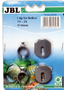
JBL SOLAR REFLECT Clip Set Holder for fluorescent tubes