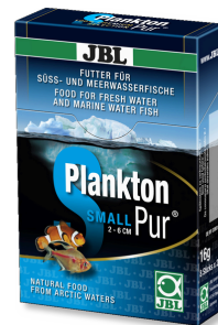
JBL PlanktonPur SMALL Treats for small aquarium fish