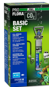
JBL PROFLORA CO2 BASIC SET M CO2 fertil. system basic compl. set f. aquarium plants