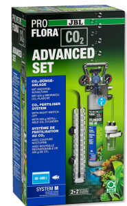
JBL PROFLORA CO2 ADVANCED SET M CO2 plant fertilis. system compl. set+night switch-off