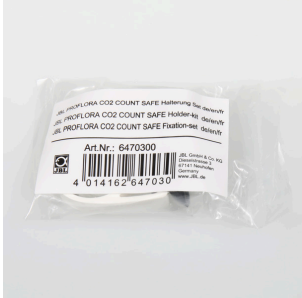
JBL PF CO2 COUNT SAFE holder set