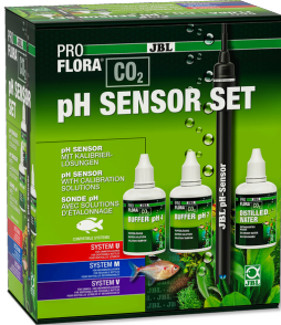
JBL PROFLORA CO2 pH SENSOR SET pH electrode, labor. quality for almost all pH devices