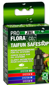
JBL PROFLORA CO2 TAIFUN SAFESTOP Water backflow protection for CO2 systems