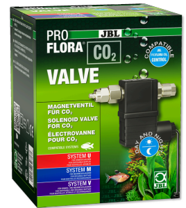
JBL PROFLORA CO2 VALVE CO2 solenoid valve for regulated CO2 addition