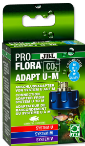
JBL PROFLORA CO2 ADAPT U - M CO2 conversion adapter disposable to refillable bottle