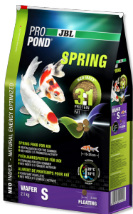
JBL PROPOND SPRING S Spring food for small koi