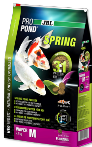
JBL PROPOND SPRING M Spring food for medium-sized koi