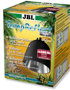
JBL TempReflect light Reflector screen for energy- saving lamps