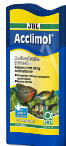
JBL Acclimol Water conditioner for acclimatisation