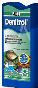
JBL Denitrol Bacteria starter for adding aquarium fish