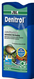
JBL Denitrol Bacteria starter for adding aquarium fish