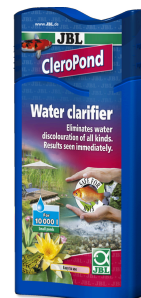
JBL CleroPond Water clarifier for the elimination of water cloudiness