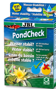
JBL PondCheck Quick test to determine the pH and KH values