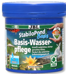
JBL StabiloPond Basis Basic care product for all garden ponds