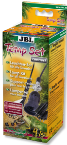
JBL TempSet connect Installation kit with connector