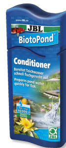
JBL BiotoPond Water conditioner for ponds