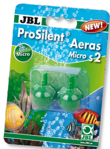
JBL ProSilent Aeras Micro S2 Ball air stones for fine air bubbles in aquariums