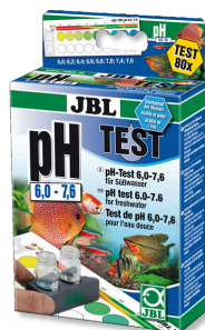
JBL pH Test 6.0-7.6 pH test for freshwater aquariums in the range 6.0-7.6