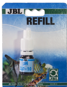
JBL pH Test 3.0-10.0 Quick test to determine the acidity