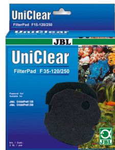
JBL FilterPad F35 Fine foam pad for aquarium filter CristalProfi